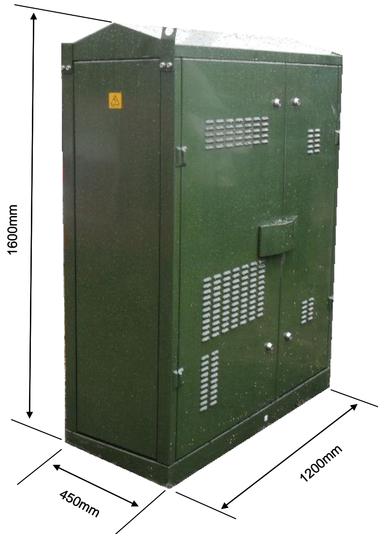
Huawei 288 Cabinet